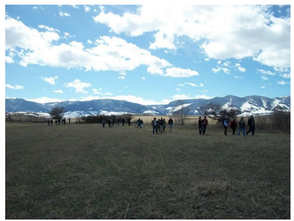
Workshop participants conduct a site walk of a 450 acre property on a beautiful April day.

Hearing about tangible examples of successful conservation subdivisions is a powerful aide in educating and helping folks to understand the menu of options that should be available for this type of development. However, nothing can take the place of physically walking a piece of property, so the workshop spent a good portion of the afternoon on a 450 acre tract of land west of Sheridan putting it through the paces of Conservation Subdivision Design.